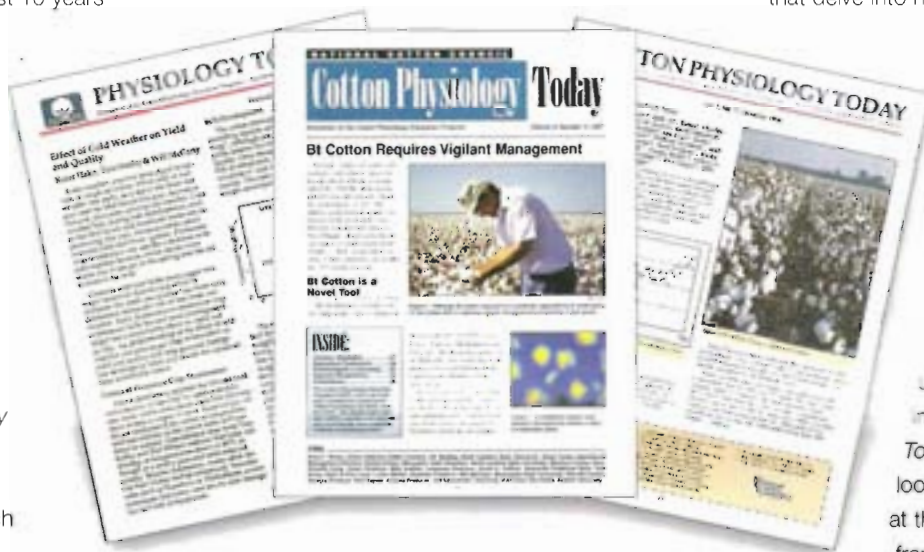
Progression of newsletters.