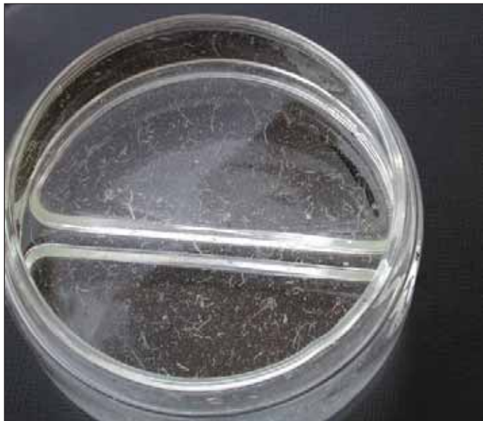
Figure 6. Worms flushed from an SDI system. Flushing twice a week solved the problem.

Back-siphoning is the backflow of water from the soil profile back into the tape at the end of an irrigation cycle. It is caused by a vacuum that develops as residual water in the tape moves to the lower elevations in the field. Back-siphoning may pull soil particles and other debris through emitters and into the tape. Figure 6 shows some live worms that were flushed from SDI lines during normal maintenance. It is thought that the eggs or cocoons of worms were pulled into the drip lines at the higher elevations in the field when zone valves were closed. Once in the drip lines, the eggs hatched and the worms started to grow. Worms and other contaminants were removed during normal flushing cycles (every 2 weeks).