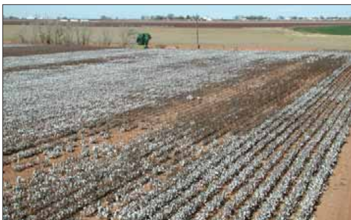
Figure 3. (Top) Plants in this field are drought-stressed because emitters are clogged. (Bottom) Acid injection can reduce clogging problems so fields are irrigated uniformly.