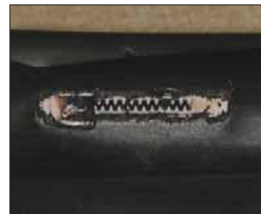
Figure 4. An emitter clogged by manganese oxides.

It is hard to eliminate iron bacteria, but it may be controlled by injecting chlorine into the well once or twice during the season. It might also be necessary to inject chlorine and acid before (upstream of) the fil-