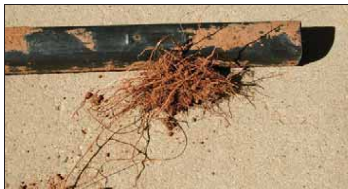
Figure 5. Roots penetrating a drip emitter.

It is important to keep plant roots from penetrating the drip emitters (Fig. 5 shows a root intrusion problem). Metam sodium and trifluralin are two compounds that control roots. In cotton, metam sodium is generally used at defoliation to keep roots out as the soil dries,