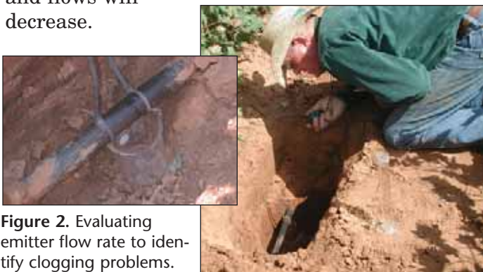
Figure 2. Evaluating emitter flow rate to identify clogging problems.

One way to evaluate clogging problems is to place a container under selected emitters as shown in Figure 2. The emitter flow rate (volume over time) collected at different locations should be compared against the design flow rate. The upper picture of Figure 3 shows a field where plants are stressed because emitters are clogged by manganese oxides. The general condition of a drip system can be easily evaluated by checking system pressures and flow rates often. If emitters become plugged, system pressures will increase and flows will decrease.